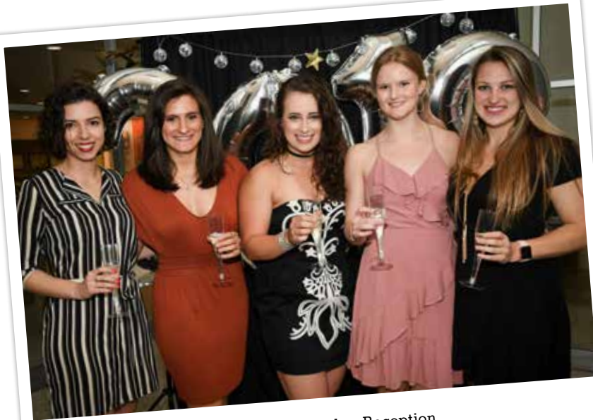
A Week To Remember Reception