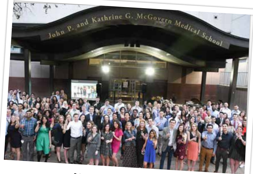
A Week To Remember Reception