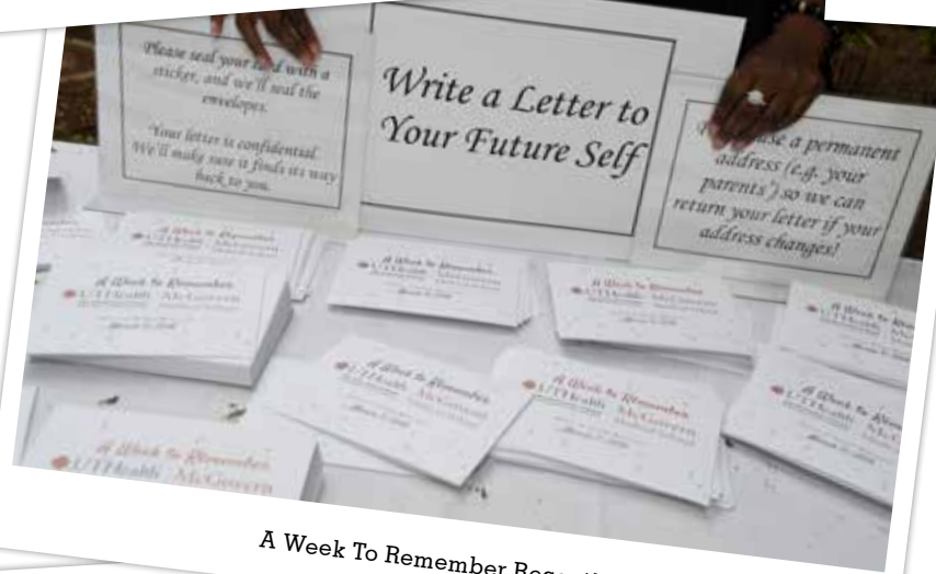
A Week To Remember Reception