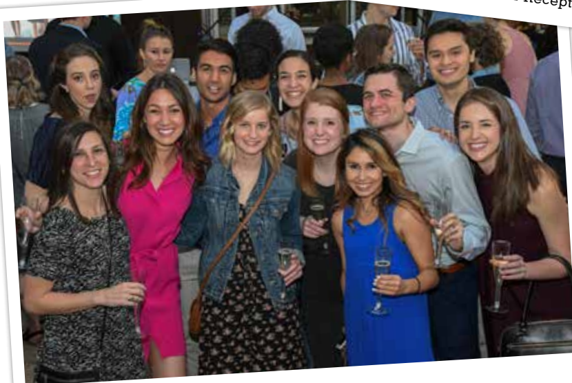
A Week To Remember Reception

milestones, but they necessitate immediately orienting toward the future at full speed, without giving us the chance to stop for that brief moment of in-between, to take in where we are right now, and appreciate the scale of what we've accomplished together. We wanted to fill that gap."