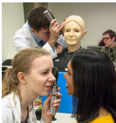
Students working together to learn anatomy (top). Students practicing their neurological exam skills (bottom).

In August 2016, McGovern Medical School implemented the first phase of its curriculum revision. The Integrated Medical Science (IMS) curriculum covers the first 20 months of students' preclinical education. The new curriculum explicitly integrates the scientific basis of medicine with relevant clinical experiences within and across each year of learning. It has three guiding principles – integration, application, and personalization.