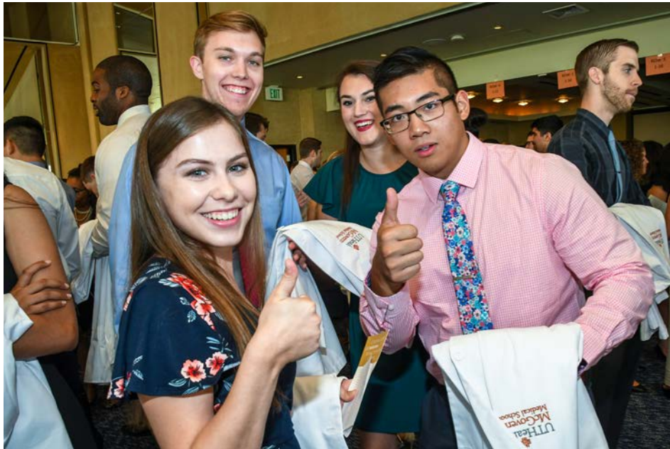
With coats in hand, students ready for the start of the White Coat Ceremony (above). The Arnold P. Gold Foundation provides “Keeping Healthcare Human” lapel pins to all incoming students as part of the White Coat Ceremony (top right). Students sign in after reciting the Oath of Hippocrates during the ceremony (right).