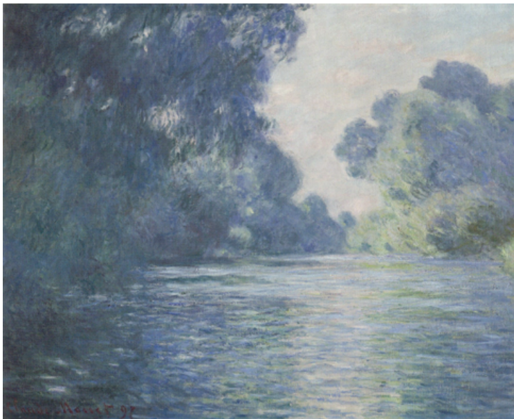
Arm of the Seine near Giverny, Claude Monet, 1897. This painting shows exactly the same setting along the river as in Morning on the Seine, Giverny. However, it was painted later in the morning and shows details that are visible in the late morning's clear and bright light.*