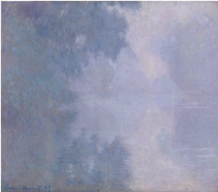
Morning on the Seine, Giverny, Claude Monet, 1897. This work shows the day's earliest emergence, "when the sun has barely begun to rise and the light is only a promise of what is to come," as described in the exhibition catalogue.*