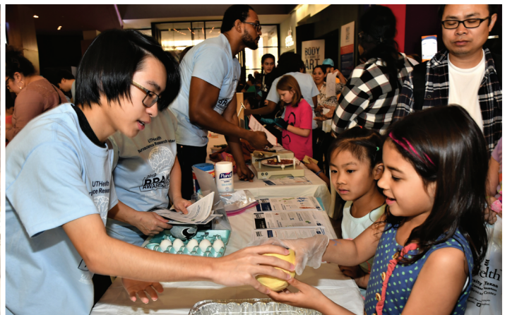
Above: The NRC's annual Brain Night for Kids attracted over 1,500 children and family members to the McGovern Health Museum on March 14. With the help of UTHealth students, post-docs, faculty and staff, kids enjoyed the chance to hold a real human brain and to participate in an egg drop activity that shows the importance of wearing bike helmets.