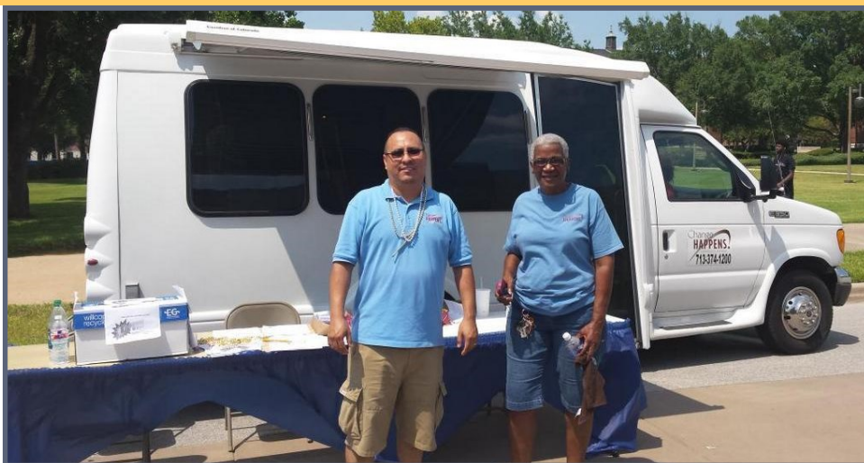
HIV testing is one of the services provided to students through the KAPOW! Project.

Prairie View A&M University, the first state supported College in Texas for African Americans, is one of the 104 recognized Historically Black Colleges and Universities (HBCU) established in the United States. Its location in Wal-