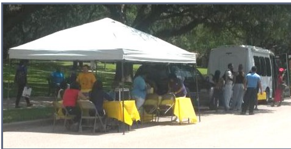
The Mobile HIV testing unit maximizes impact by targeting popular student events.

KAPOW! will next extend these mobile services to the rural community. Recently, the mobile testing unit made its first appearance in Waller County at a Narcotics Anonymous Meeting. Five high risk adults were testing and participated in a VOICES class. One participant wished these preventative services would have been available years ago.