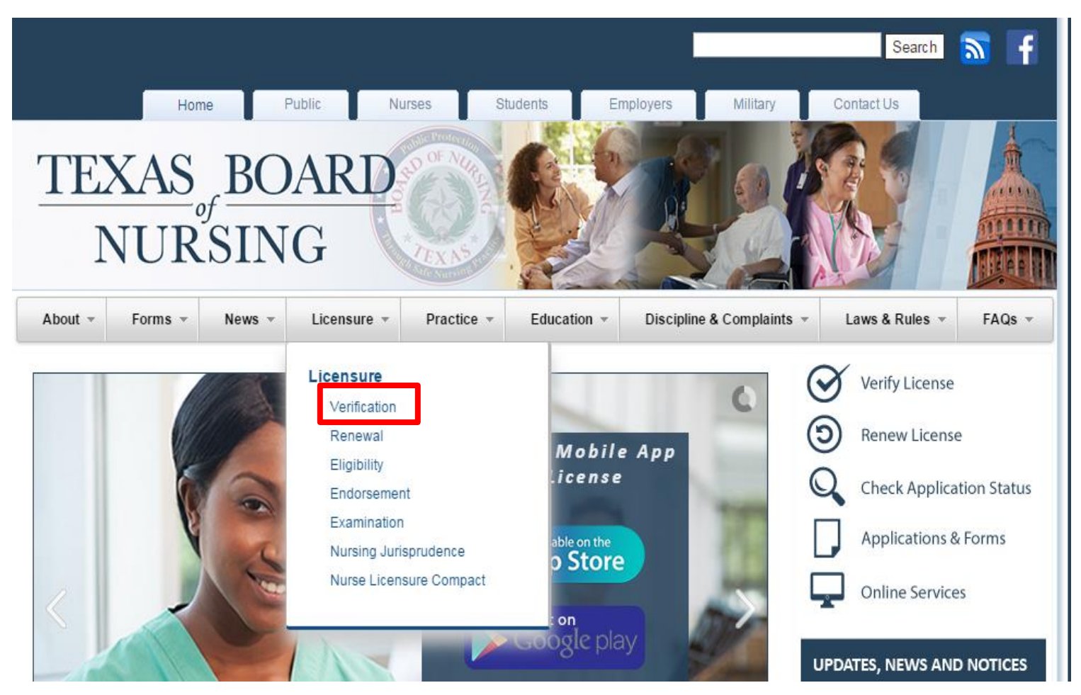
Page 1 of 4