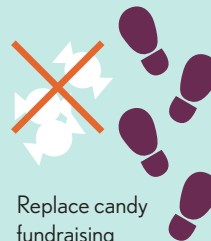
Replace candy fundraising with charity walks.

Follow the doctor's orders: no more than 2 hours in front of a screen per day.