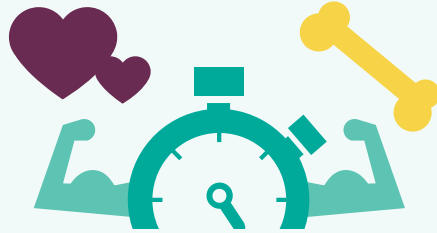
Activity strengthens the heart, muscles, and bones!

Regular physical activity is important for your child's overall health and wellbeing.