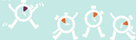
"Toe Touches" break up the day.