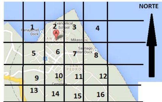
Figure 2. Example of map divided in quadrants.

For each selected PSU, B&A will create a map via Google Maps®, a freely accessible, accurate, and up-to-date online cartographic service. This service is superior to most countries' officially available maps as they are not as frequently updated as Google Maps®. Each map will be divided into 16 quadrants, numbered from 1 to 16 as shown in Figure 2, ensuring that the map clearly marks the north point. One quadrant will be randomly selected for conducting the interviews. The Fieldwork Collectors team will start their route to recruit participants from the northernmost point of each selected quadrant to complete the 12 interviews for this PSU. If the selected quadrant is mostly comprised of an area without households (e.g., quadrants 1 or 4 in Figure 2), another quadrant will